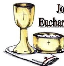
John XXIII Eucharistic Ministers